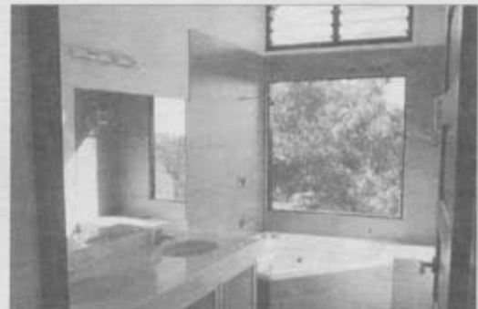
Green with envy : Home and Away soapie star Isabel Lucas (left) has built an environmentally friendly home (pictured top), which features a spa (middle) and three bathrooms.